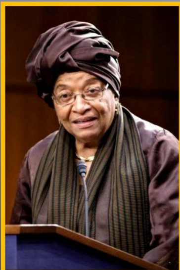
Ellen Johnson Sirleaf