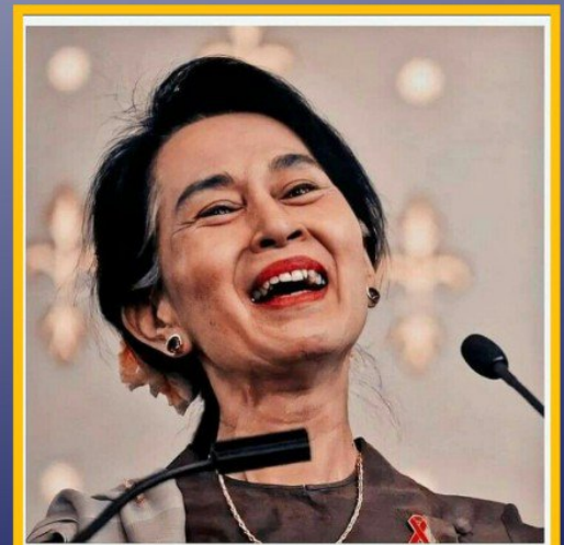
Aung San Suu Kyi