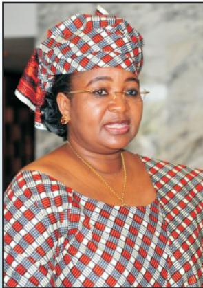
Her Excellency Selma Kikwete First Lady of Tanzania