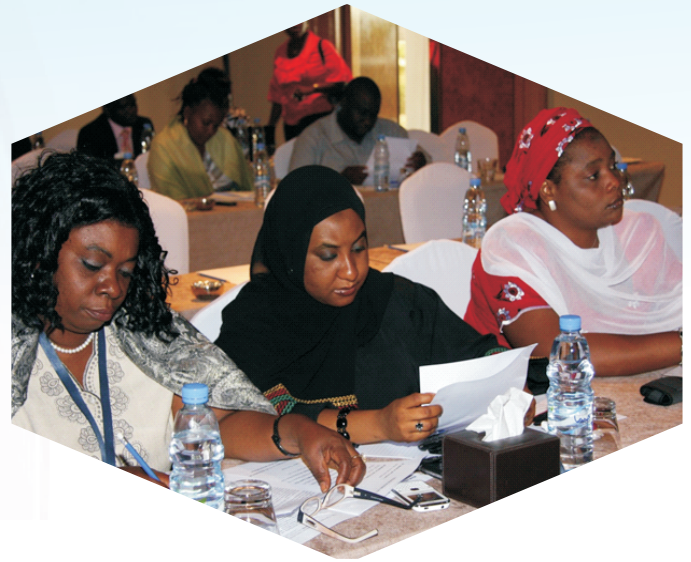
Cross section of participants at a CELD Conference