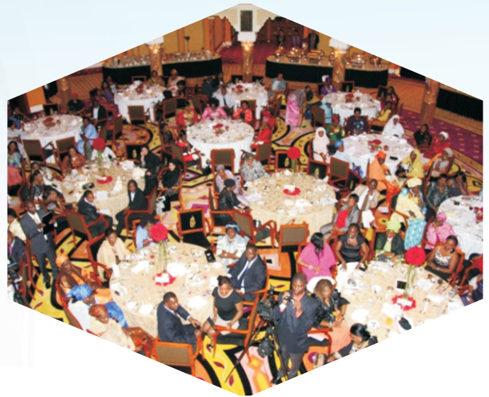
A Cross section of Guests at the 2012 African Women Development Awards Ceremony, Burj Al-Arab Hotel, Dubai UAE