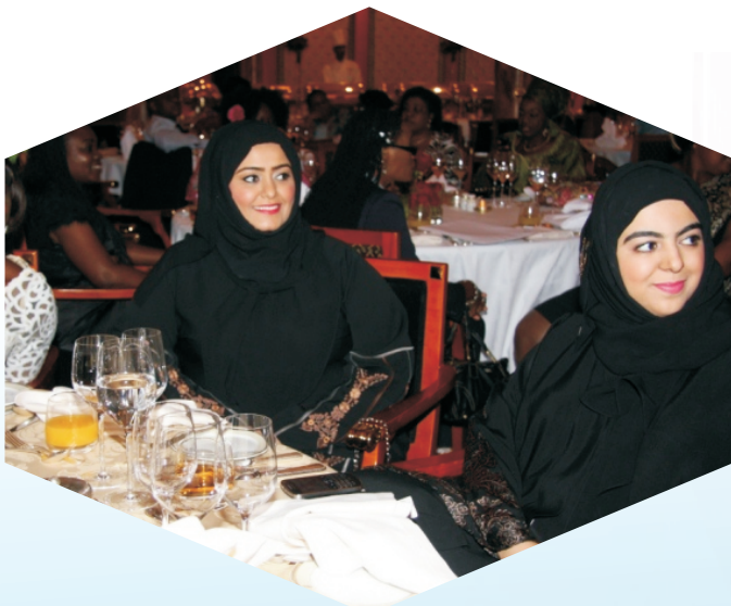
Representatives of the Dubai Foundation for Women and Children during the 2012, International Conference on African Women Development Dubai