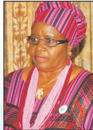
Her Excellency Penehupifo Pohamba First Lady of Namibia