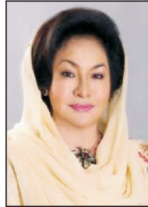
Her Excellency Datin Maduka Seri Rosmah Mansor Wife of the Prime Minister of Malaysia