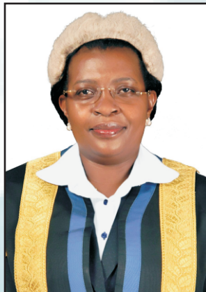
Rt. Honorable Margaret Zziwa Speaker, East African Legislative Assembly