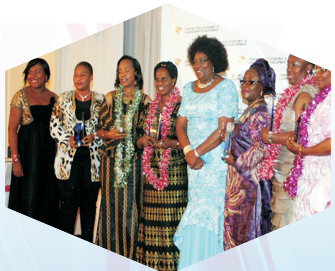
From 21-24 November, 2012, CELD successfully held her 2nd All Africa Women Leaders' Summit at the Hilton, Nairobi-Kenya.