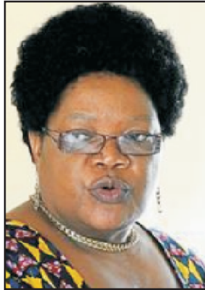
Her Excellency Joice Mujuru Vice President of Zimbabwe