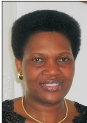
Her Excellency Bucumi Nkurunziza First Lady of Burundi