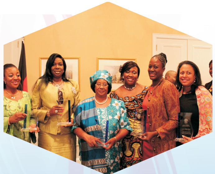
President Joyce Banda of Malawi and other award recipients during a CELD event at the Waldorf Astoria, New York